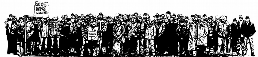
Picket line at APM Terminals Gothenburg, 17th of May 2016

The Gothenburg container terminal, the largest in all the Nordic countries, has experienced problems since APM Terminals (APMT) obtained the concession. Repeated crisis' have led to a dramatic drop in market shares, from 57% of the Swedish container market to 45% in just a few years.